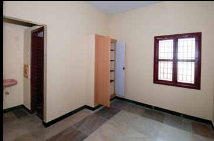
Medical clinic patient room