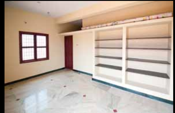
Sick bay area