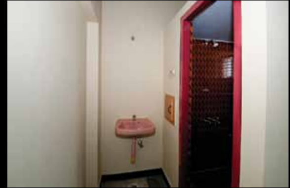
Patient room lavatory

Examples shown here include lavatories that are accessible outside the toilet area and toilet and shower areas that are fully tiled for efficient hygienic maintenance. Other considerations include easy access to patient rooms, ease of visual observation of patients, marble tile floors for durability and ease of cleaning, adequate storage cabinets, and well placed windows for light, ventilation and a peaceful view.