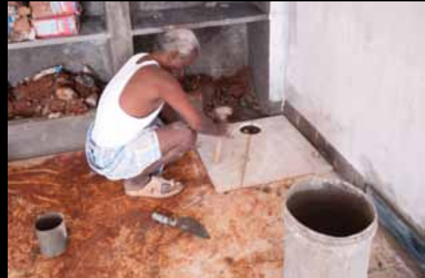
Craftsman fitting a marble floor tile