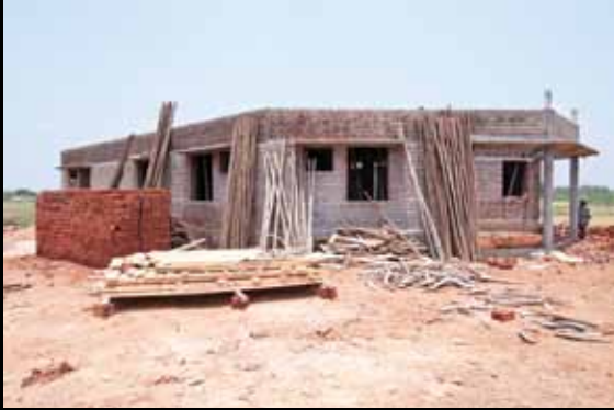
Special Care Facility

The Special Care Facility will be dedicated to the individuals that for a variety of reasons may be at risk to themselves or others and therefore need to be reasonably isolated. The facility will be able to support up to thirty residents.