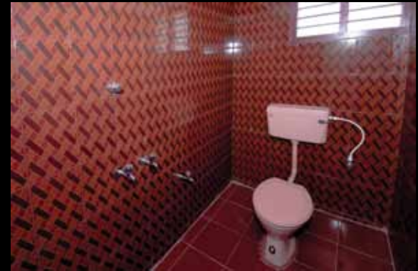
Patient room toilet