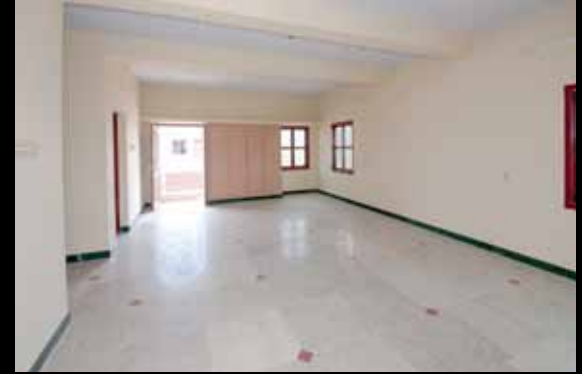
Triage and emergency care area

The Medical Care Facility's sick bay will house those residents that must be isolated from the rest of the population and need supervised medical care.