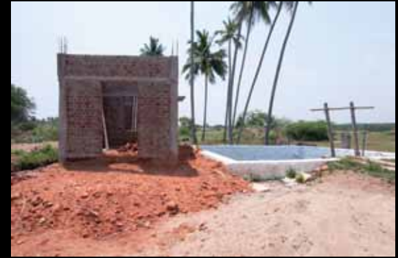
Security station and well

The Akshaya Home is a place for today's helpless homeless and with appropriate support will be able to address tomorrow's needs as well.