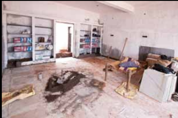
Floor tile ready to be polished

The proper installation of quality building materials is a basic step in creating an efficient and easily maintained facility. These photos show the care being taken to assure the marble floor tiles and wood doors and shelving are properly installed and finished.