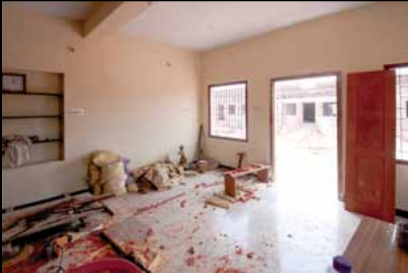
Woodwork fitting and installation