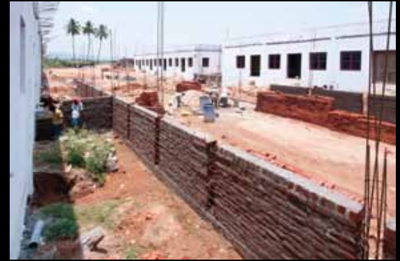
Retaining wall for covered walkway

The concrete strips on the ground are the foundations for a bridge between the building blocks. The bridge will give the Akshaya Home the ability to efficiently and safely move residents between the residential areas and the medical clinic.