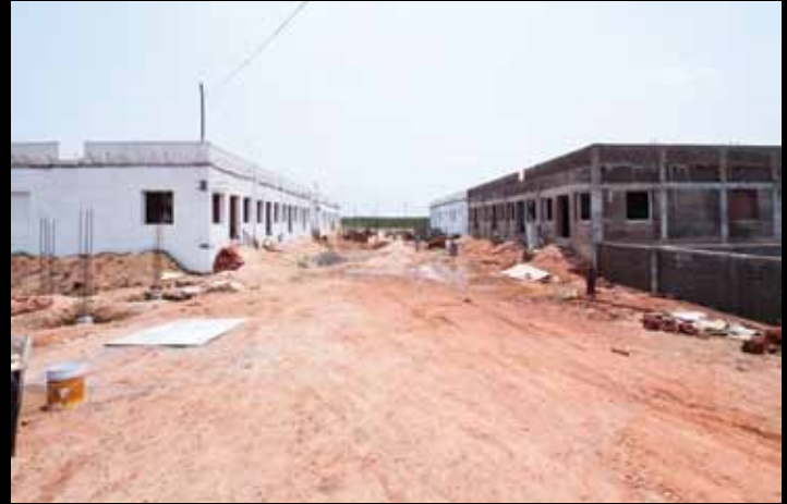
Blocks 1, 2, 3 and 4