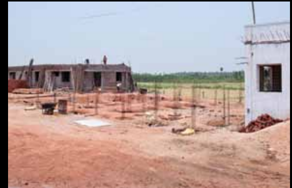
Dining room foundations