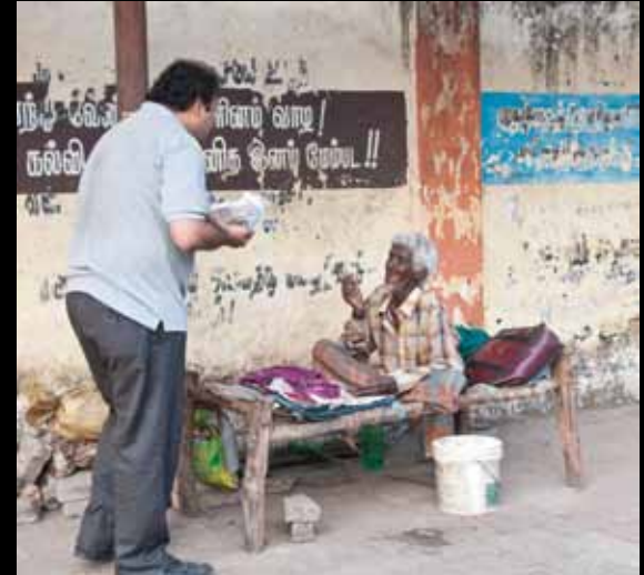
Waiting for the Akshaya Home

Akshaya will also work with secular volunteer groups to provide social programs aimed at giving the residents a sense of community.