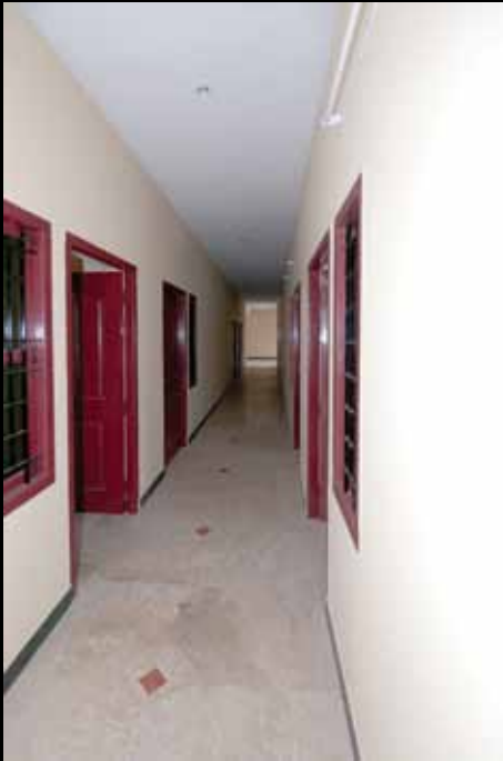
Medical clinic corridor to patient rooms