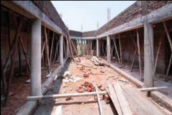
Special Care Facility open area

The Special Care Facility will be dedicated to the individuals that for a variety of reasons may be at risk to themselves or others and therefore need to be reasonably isolated. The facility will be able to support up to thirty residents.