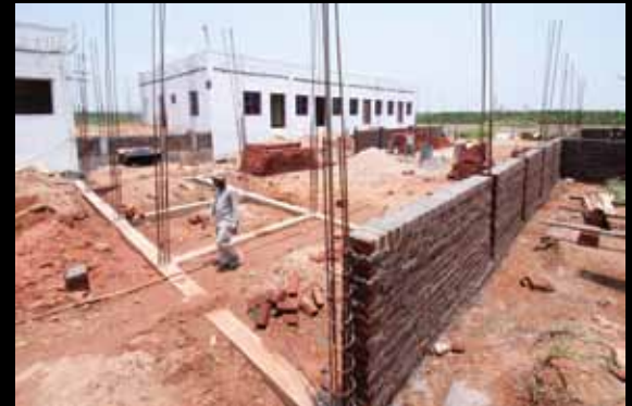
Connecting bridge foundation